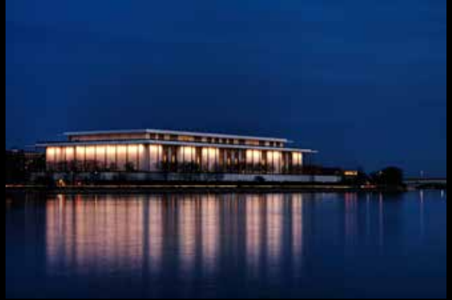
John F. Kennedy Center for the Performing Arts - Washington DC