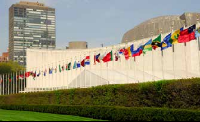
United Nations Headquarters - New York